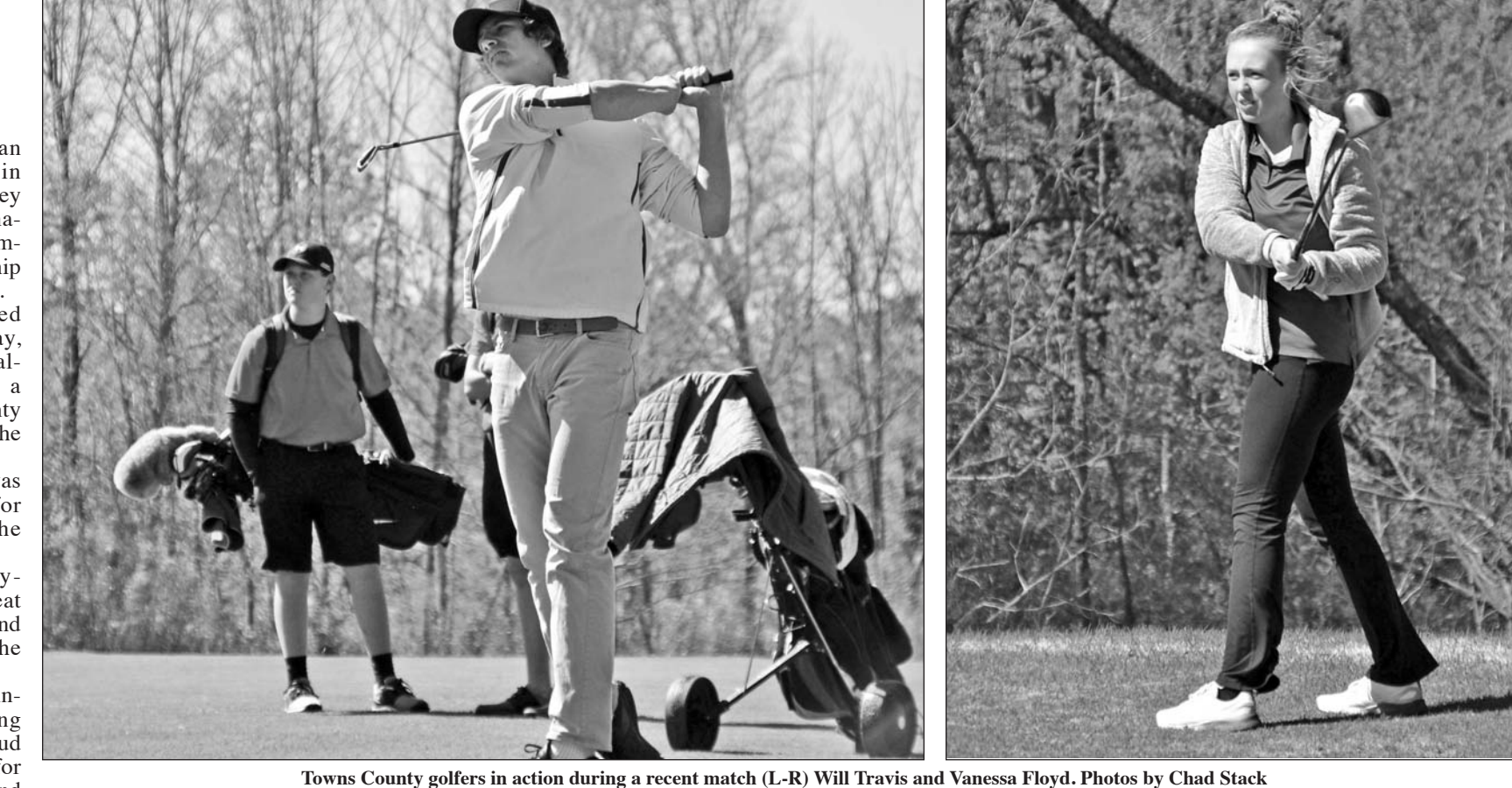
The lady Indians com- Indians.

"The boys have continued an impressive winning streak, and I am very proud of how they are preparing for the end of the season to try and win the area tournament and occurred after press time.